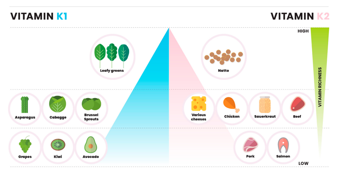
Figure 1. Dietary sources of vitamin K. Left side of pyramid displays K1 content gradient in dietary sources of vitamin K1. Leafy greens include spinach, kale and swiss shards. Right side visualizes K2 content gradient with natto being the most significant source. Various cheeses include hard and soft cheeses with K2 content being dependent on fermentation level.

Vitamin K1 is the predominant form of vitamin K present in the diet [6,7]. K1 is predominantly found in green vegetables and plant chlorophylls, whereas K2 menaquinones are synthesized by bacteria [8] and are primarily found in food where bacteria are part of the production process [5,9]. Major sources of K1 include spinach, cabbage, and kale, and absorption of dietary K1 is increased in presence of butter or oils. Beyond leafy greens, K1 can also be found in fruits like avocado, kiwi and grapes [10,11]. The main known sources of K2 are fermented food, meat, and dairy produce [12] (Figure 1). Fermentation of soy beans with Bacillus natto produces Natto, a Japanese dish that contains the highest content of K2, in particular MK-7 (321 ng/g of K1, and 10,985 ng/g of K2) [13]. Dairy products are the second richest source of K2 in the diet. Hard cheeses are considered to have the highest amount of menaquinones [14]. Other notable sources of K2 are chicken meat, egg yolks, sauerkraut, beef and salmon [12] (Figure 1).